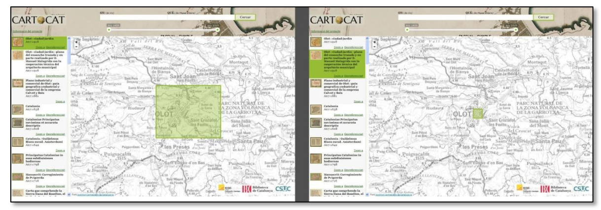
Figure 3 Two copies of the same map georeferenced with different methods