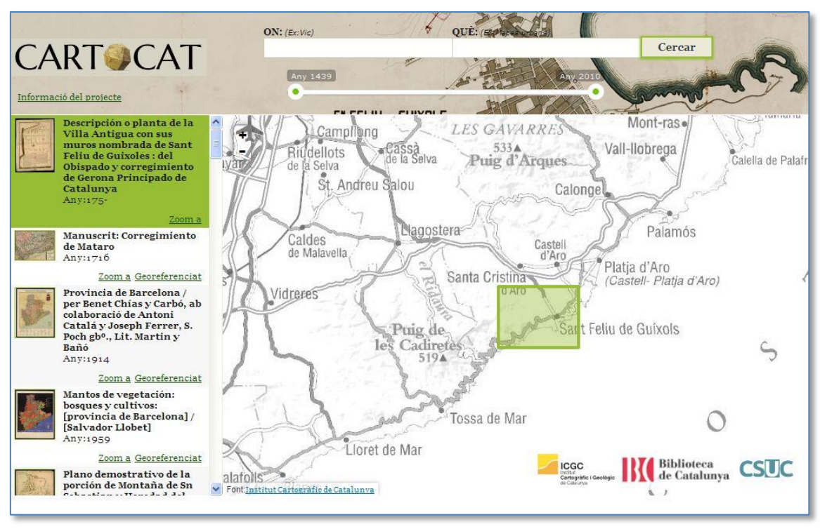
Figure 5 The Cartocat portal created to browse the objects described in the SDI metadata catalog

Providing more elaborated tools to patrons and users results in better understanding of its' usage, which in turn means farther reaching diffusion and thus, we hope, much higher reuse of this type of cartographic heritage materials.